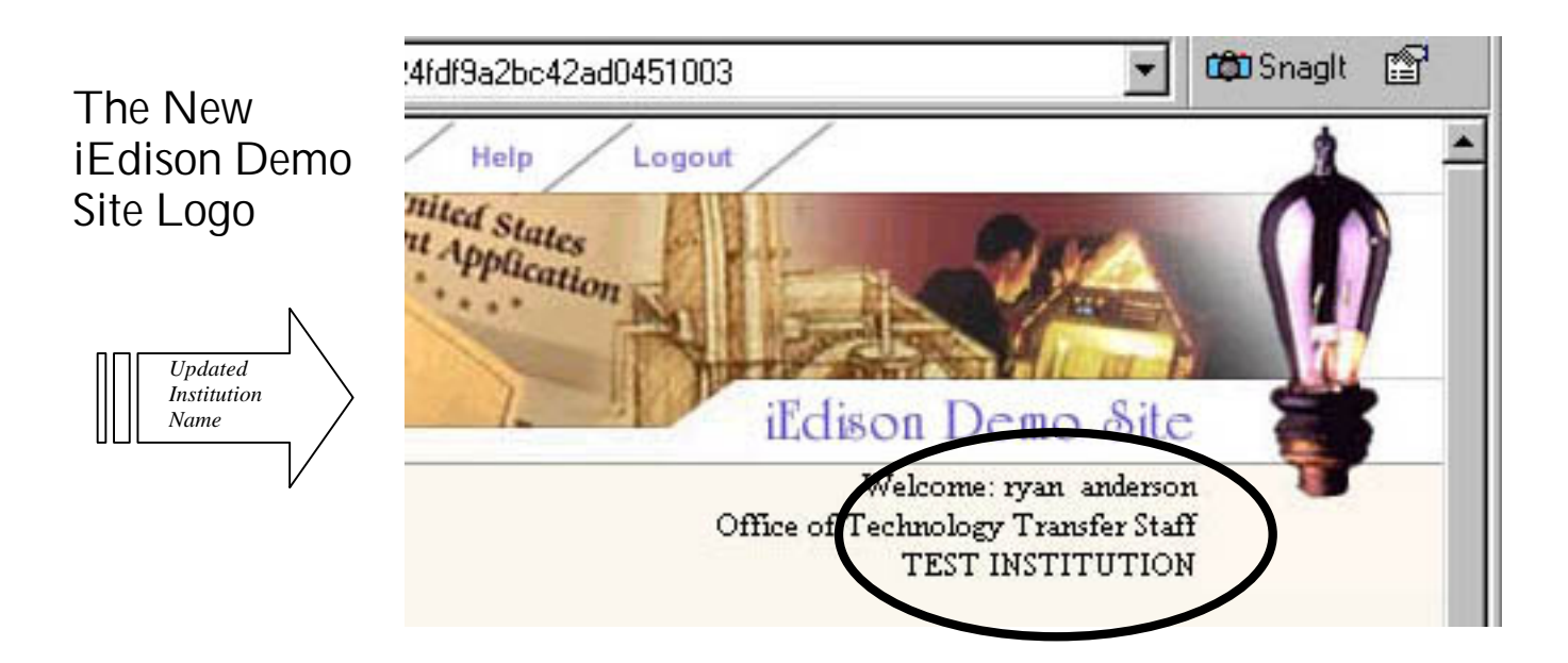
Figure 1 – The New iEdison Demo Site Logo